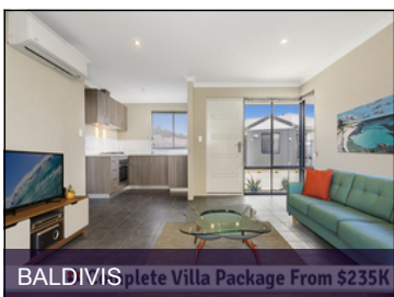
BALDIVIS plete Villa Package From $235K

Address 2/71 Kingaroy Drive, Baldivis, 6171